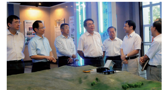
白春礼院长听取“高海拔宇宙线观测站”进展汇报 The president of CAS BAI Chunli was briefed by session of LHAASO