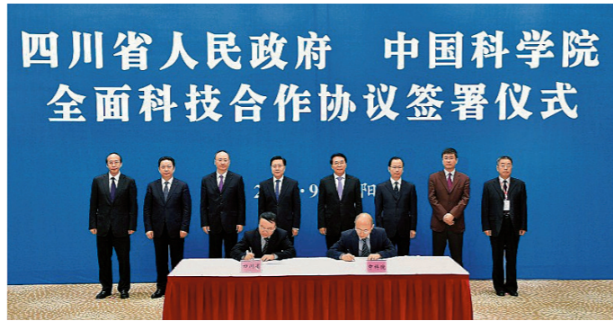
中国科学院与四川省人民政府签署“十三五”全面科技合作协议 The CAS signed the 13th five-year S&T cooperation agreement with the people's government of Sichuan province

The Scientific and Technological cooperation department of Chengdu Branch, Chinese Academy of Sciences(CAS), surrounding the important strategic plan of Chinese Academy of Sciences and major S&T demands in Sichuan Province, Chongqing Municipality and the Tibet Autonomous Region, integrates innovative resources effectively and promotes the coordinated development of CAS and regions with “the Three Orientations” policy as a leading idea and major output as guidance. Remarkable accomplishments have been achieved including the innovation and development of new park of Chengdu branch, the construction of major S&T infrastructures and S&T service network, with management experience being accumulated and practical and innovative core team being fostered. According to incomplete statistics, in 2016, CAS helped enterprises in Sichuan, Chongqing and Tibet increase sales income by 21.1 billion yuan, and earn local governments input 118 million yuan to support the key projects of CAS, which were regarded as a great breakthrough in history.