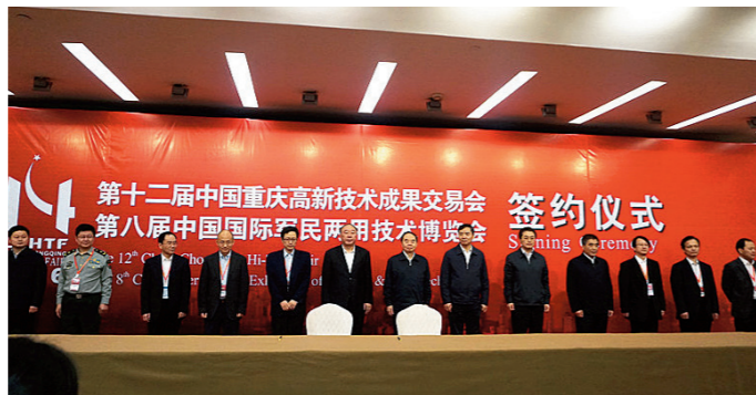
中国科学院与重庆市人民政府签署“十三五”科技合作协议 The CAS signed the 13th five-year S&T cooperation agreement with the people's government of Chongqing municipality