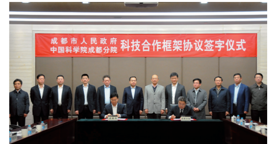
中科院成都分院与成都市人民政府签署科技合作协议 Chengdu Branch of CAS signed S&T Cooperation Agreement with Chengdu City People's Government

Maintain the core of National S&T Transferring Center, the CAS, and majorly focus on building S&T network system in Sichuan and Chongqing region. In the meantime, the co-built translational medicine research hospital, CAS, Chengdu Moziqiao Innovation and Entrepreneurship Base are brought into the transformation and transfer of service S&T achievement and regional collaboration innovation system construction. Furthermore, proactively establish the environment for Innovation and Entrepreneurship and boost the transformation of S&T achievement.