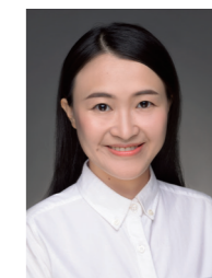
张雪琦 Zhang Xueqi