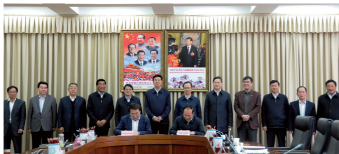
中国科学院与西藏自治区签署“十三五”科技合作战略协议 The CAS signed the 13th five-year S&T cooperation agreement with the Tibet autonomous region